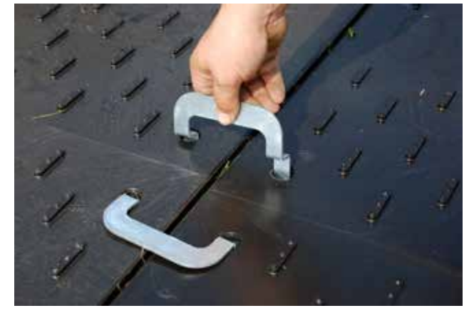
Connectors create a sturdy connection.