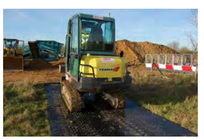
Designed to handle rugged site life.

*Minimum 2 x connectors per mat, depending on site layout.